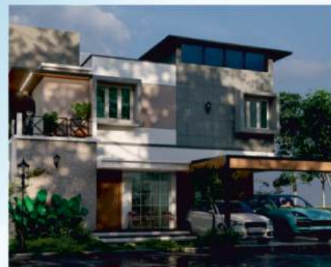
SOPHIA NEST (PALARIVATTOM)