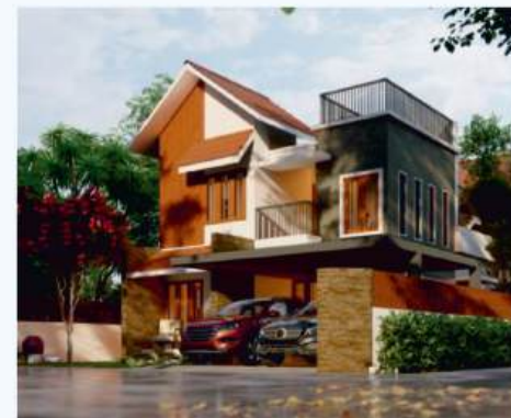
SOPHIA AMELIA (EDAPPALLY)